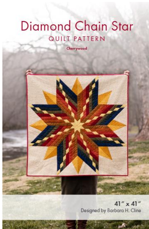
Made with Cherrywood Fabrics.