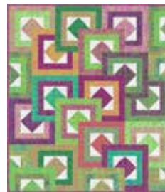
Small Lap Size