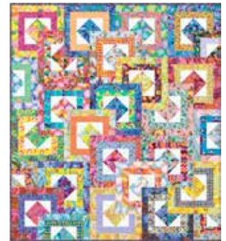
Large Lap Size