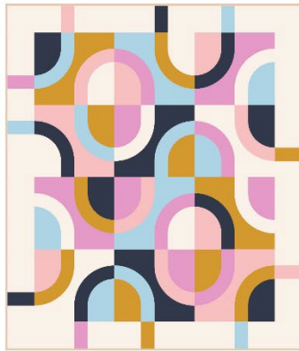
Six-Color version Standard Border