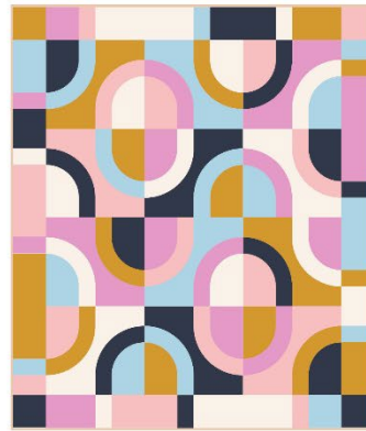
Six-Color version Scrappy Border