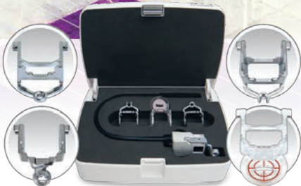
A.S.R.® (Accurate Stitch Regulator)